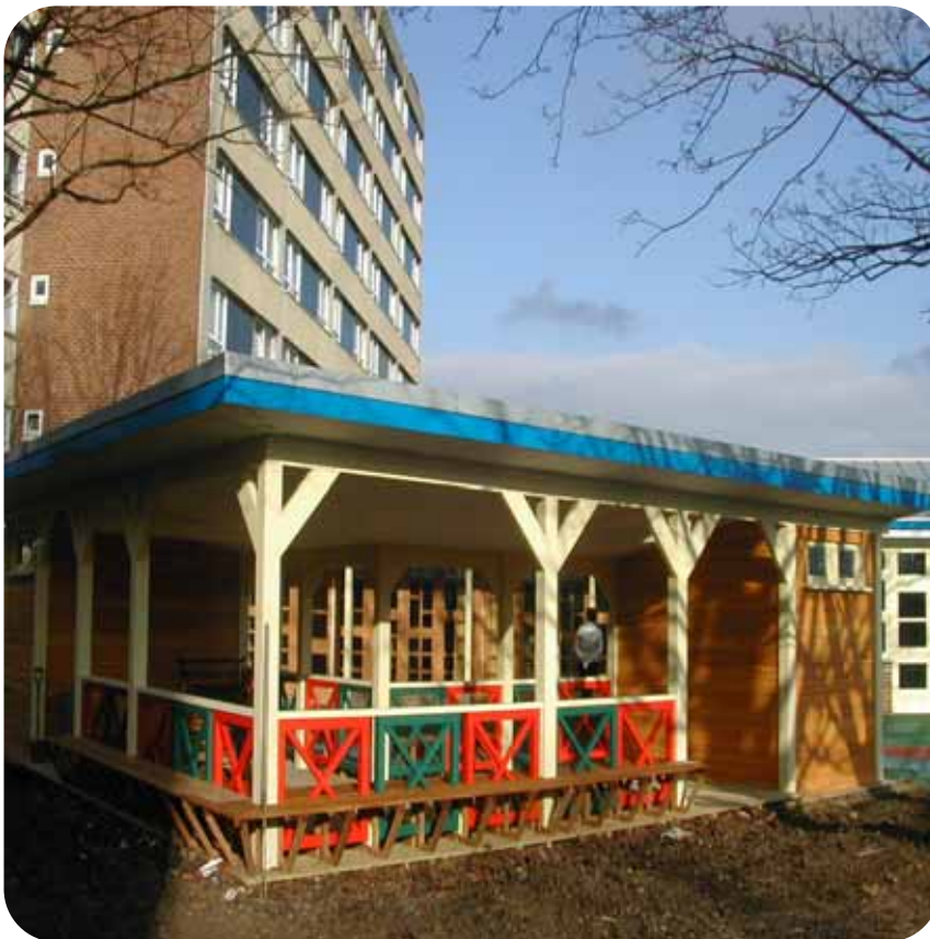
Outdoor Play Area, SureStart Somerstown, Portsmouth