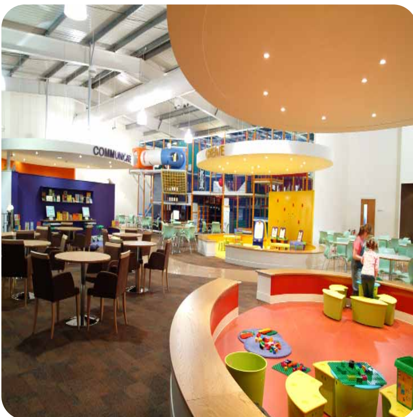
KidSports Leisure Centre, Watford

We advise clients on the best route to turn their needs into successful, attractive and cost-effective projects.