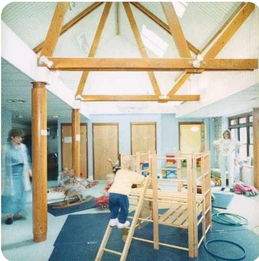
Cover picture: SureStart, Gosport Above: Activity room, Sturminster Newton Family Centre

Our approach is imaginative yet realistic.